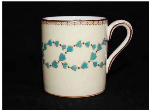
A demitasse cup, circa 1940, that was typically used for serving espresso or other strong, black coffees.