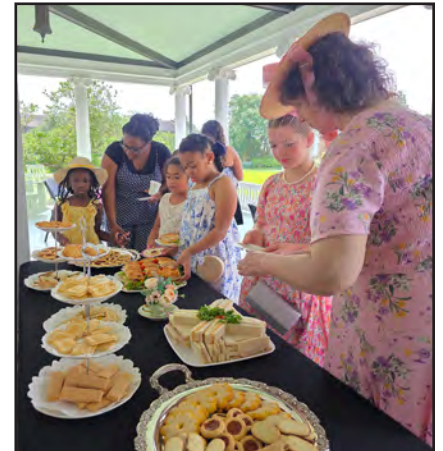
Homeschoolers enjoy the Victorian Era Etiquette Workshop.