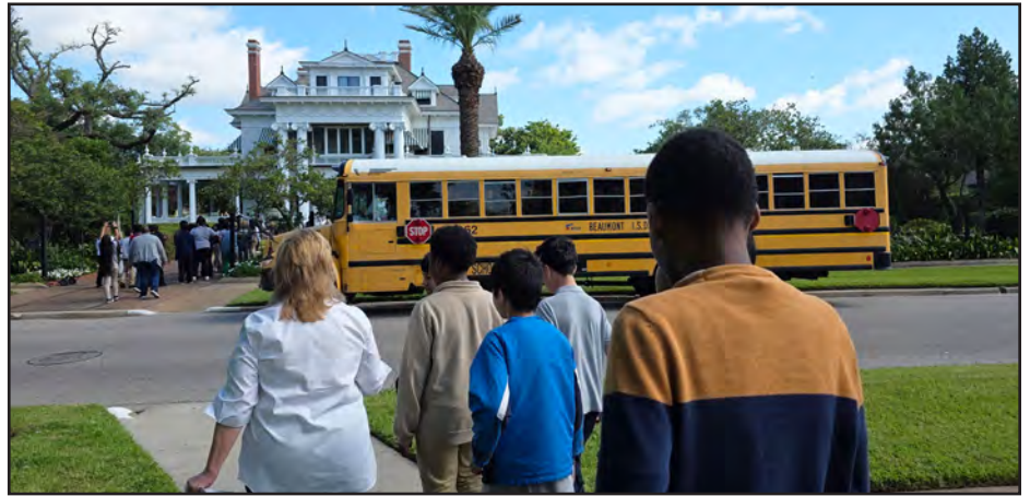
This spring, over 500 BISD seventh graders took field trips to the McFaddin-Ward House.