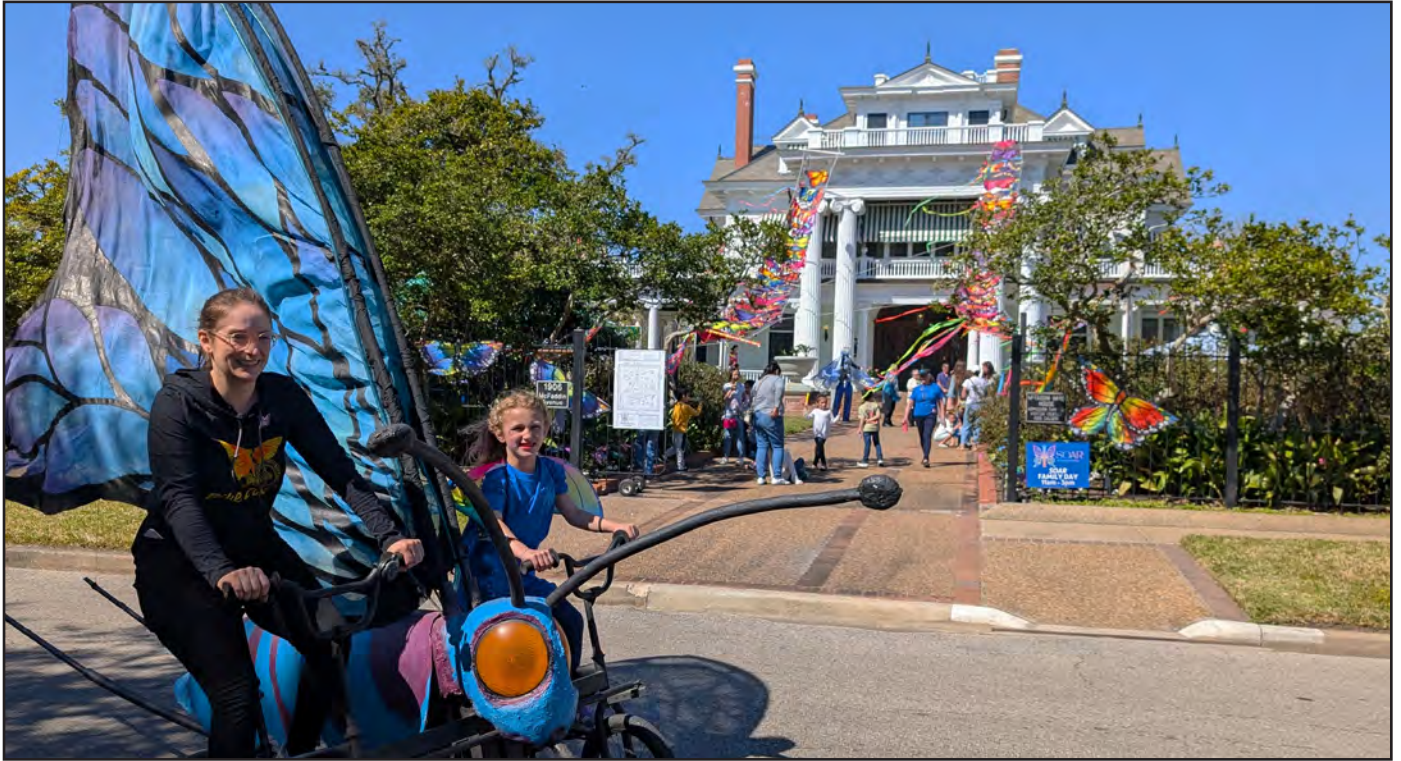
Hundreds of attendees enjoyed the festive spring activities at the museum's third annual SOAR Family Day in March.