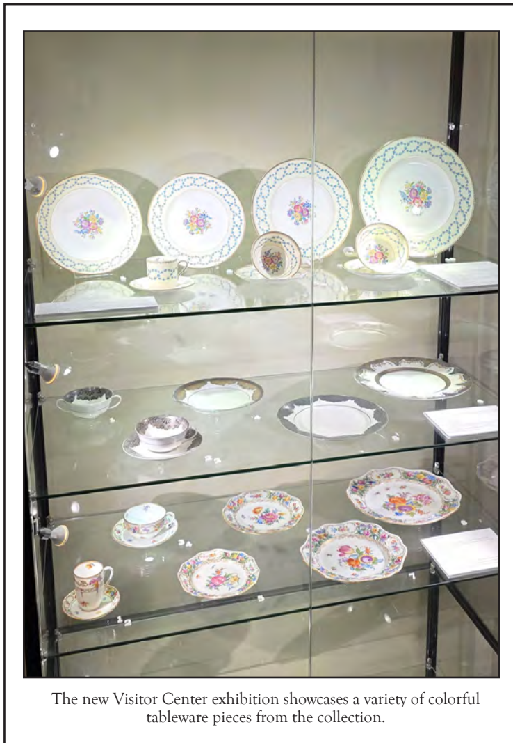
The new Visitor Center exhibition showcases a variety of colorful tableware pieces from the collection.

By Victoria Tamez Curator of Collections