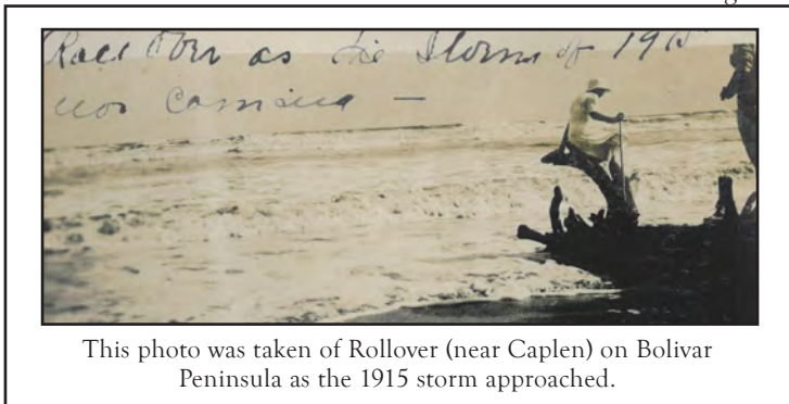
This photo was taken of Rollover (near Caplen) on Bolivar Peninsula as the 1915 storm approached.