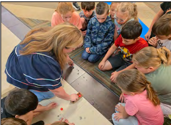
Hamshire-Fannett third graders learn to play Jacks during a Museum in a Box lesson.