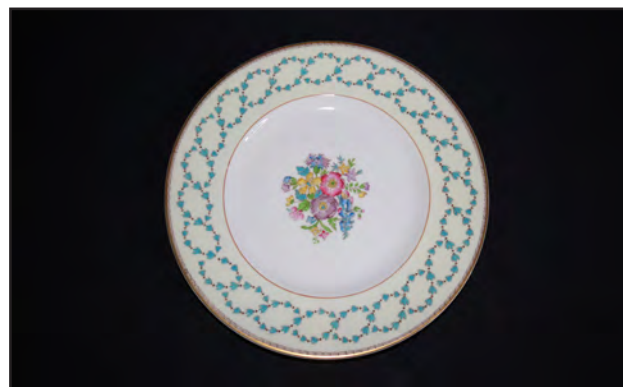
A luncheon plate, circa 1940, made by Wedgwood in the Fairford pattern featuring a turquoise laurel.