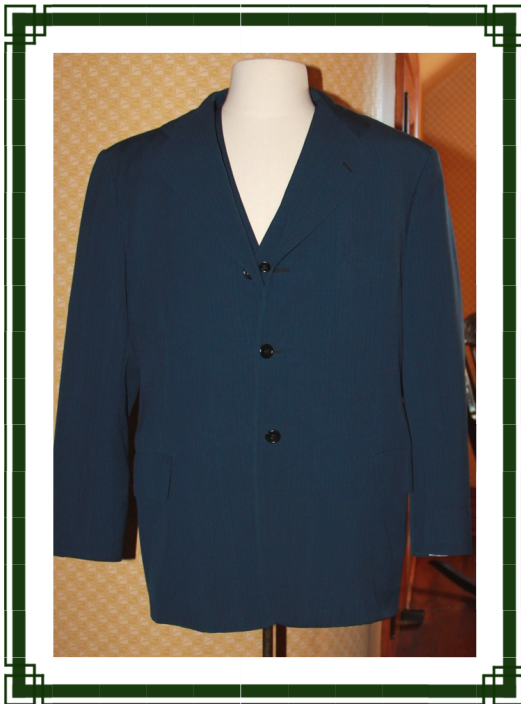
Three-piece blue suit, Paul Stutz , San Antonio, Texas, ca. 1950