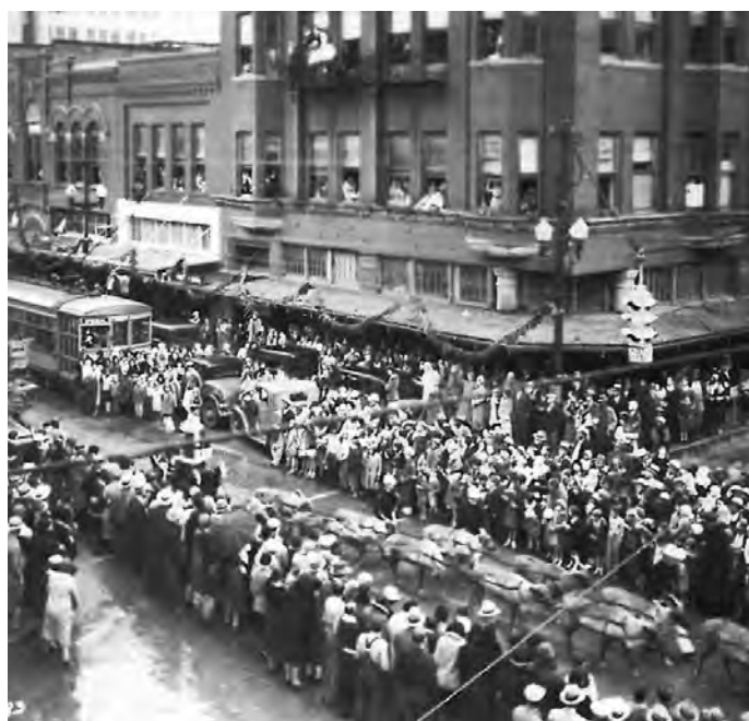
In 1930 Beaumont’s Christmas parade featured live reindeer hitched to Santa’s sleigh.

Whatever changes came, however, people continued to give gifts, send cards, sing Christmas carols, decorate trees, and eat sumptuous meals, while children patiently (or not) waited for Santa Claus. Those traditions will continue to be around for a long, long time.