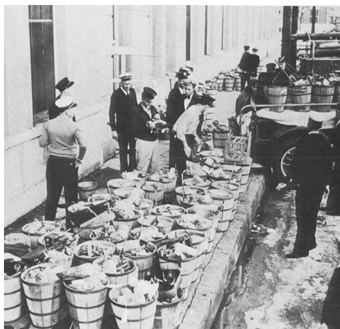
Beaumont Firefighters continued an early 1900s holiday tradition by delivering food baskets to needy families in the 1930s.