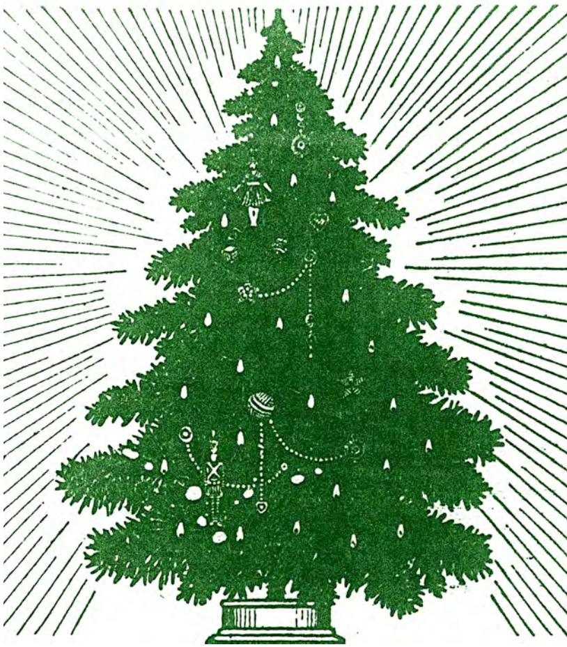
This brightly lighted radiant tree appeared in a December 1927 Beaumont newspaper. It was colorized by a former McFaddin-Ward House staffer.