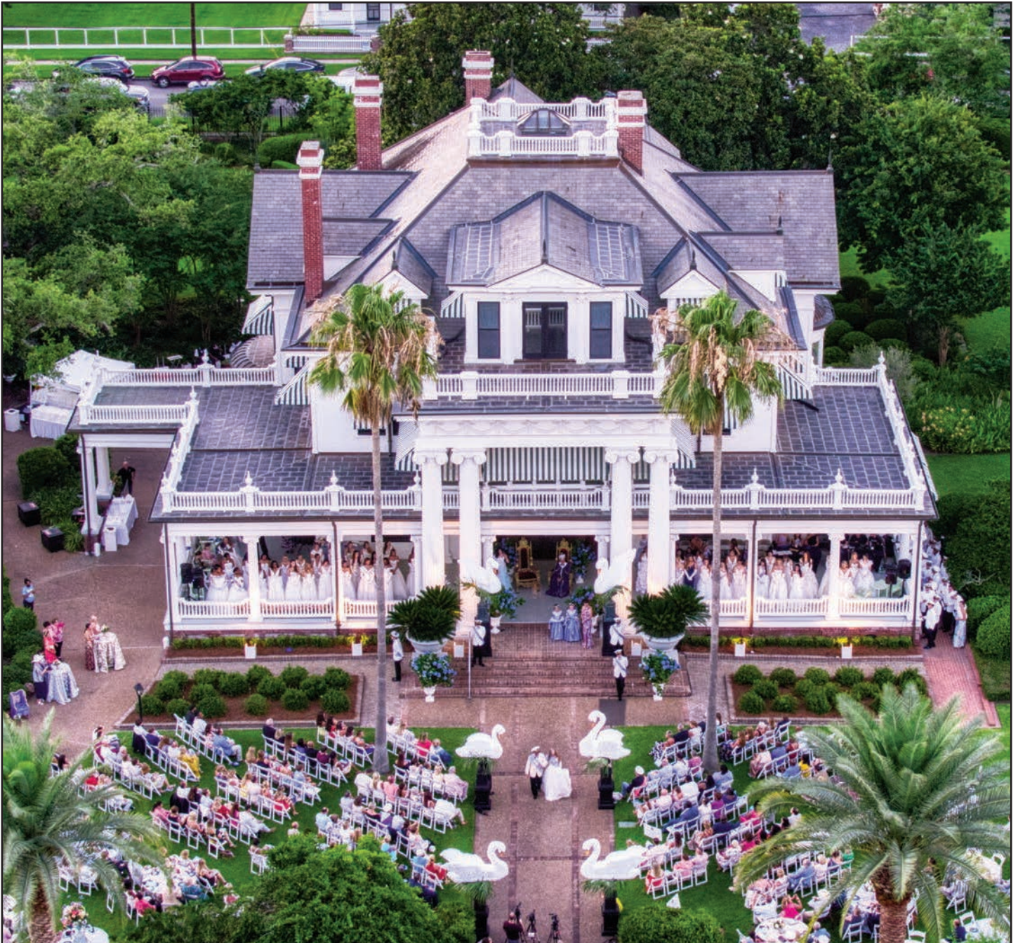
The McFaddin-Ward Museum was honored to assist our community by providing an alternative venue for the 72nd Neches River Festival — a beautiful day embracing the youth of our area.