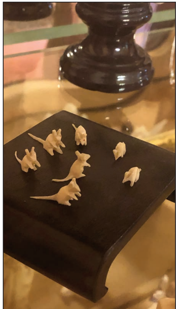
A cabinet in the Pink Parlor contains a collection of objects Mamie and Ida picked up during their travels.