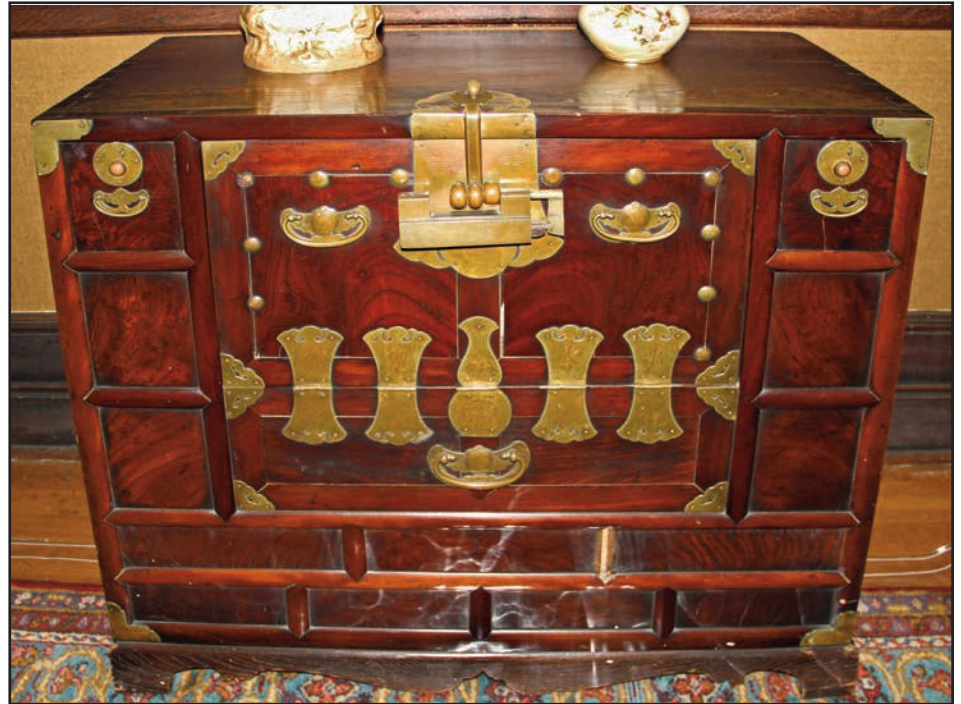
Mamie's hope chest on the second floor of the MWH.

After months of researching, we finally cracked the code, so to speak. The lock mechanism operates on prongs, rather than tumblers. We knew we needed a slender strip of metal that would compress the prongs and release the lock. A search party was formed, and museum volunteer Mike